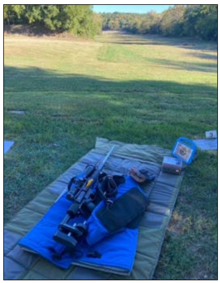
Shooting Gear ready on the firing line prior to commencement of firing