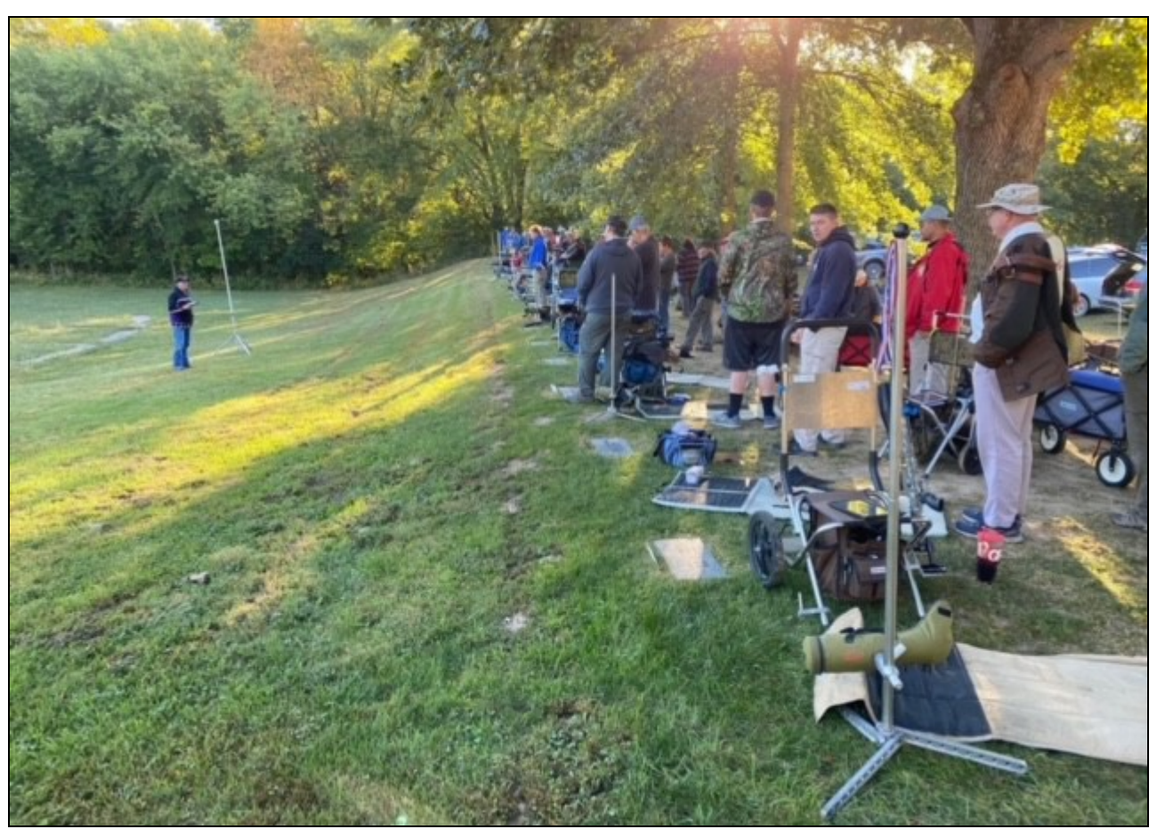
Competitors listening to the safety brief prior to the Saturday match