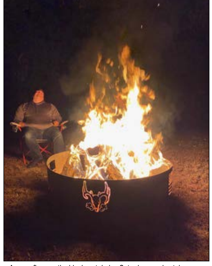
A warm fire was the ideal spot during Saturday evening take a nap