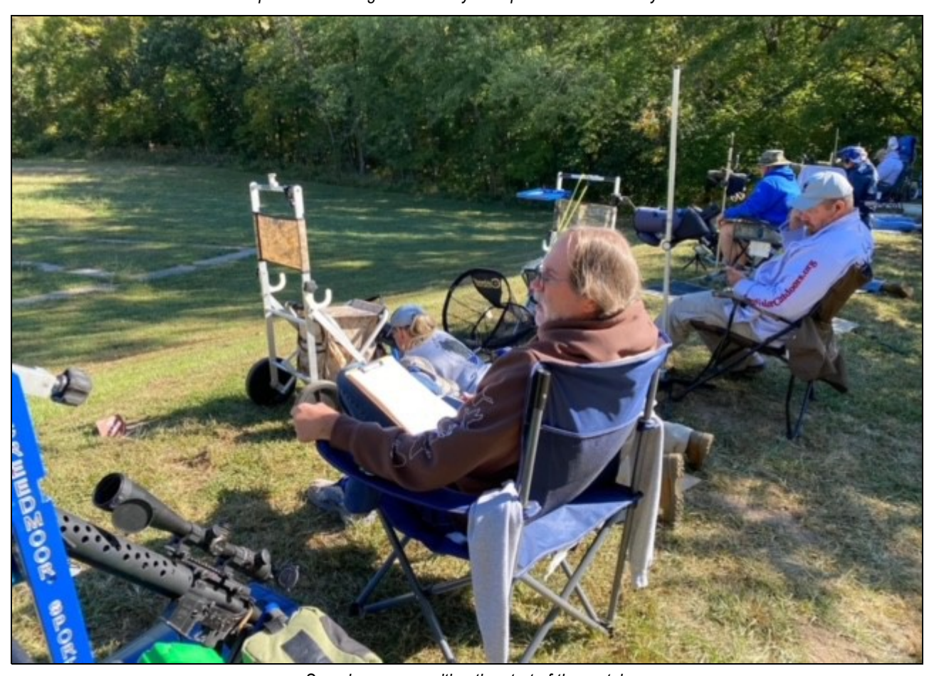
Scorekeepers awaiting the start of the match