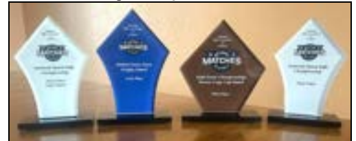
4 of the 5 National trophies at Young's home