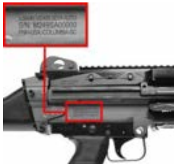
To locate the 11-digit serial number, see figure above.

Product Name: FN M249S Model Name(s): FN M249S Standard, FN M249S Para, FN M249S Limited Edition Product Numbers: 56435, 56460, 56501, 56502, 56509, 46-100028, 46-100030 Color(s): Black, Flat Dark Earth (FDE)